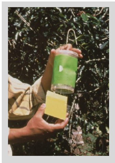
Figure 12. Open bottom dry trap (Phase IV).

A food-based synthetic chemical female biased attractant can be used to capture C. capitata . However, it also serves to capture males. Synthetic attractants are attached to the inside walls of the cylinder. Servicing is easy because the sticky insert permits easy removal and replacement, similar to the inserts used in the JT. This trap is less expensive than the plastic or glass McP-type traps.