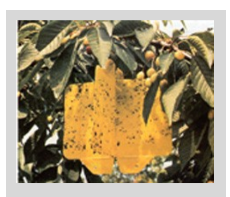
Figure 20. Rebell trap.

These traps can be used as visual traps alone and baited with TML, spiroketal or ammonium salts (ammonium acetate). The attractants may be contained in controlled-release dispensers such as a polymeric plug. The attractants are attached to the face of the trap. The attractants can also be mixed into the cardboard's coating. The two-dimensional design and greater contact surface make these traps more efficient, in terms of fly captures, than the JT and McPhailtype traps. It is important to consider that these traps require special procedures for transportation, submission and fruit fly screening methods because they are so sticky that specimens can be destroyed in handling. Although these traps can be used in most types of control programme applications, their