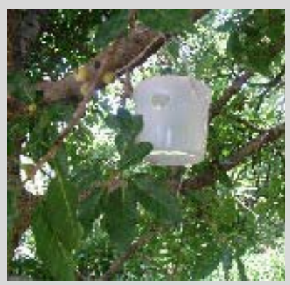
Figure 7. Maghreb-Med trap or Morocco trap.