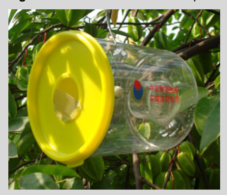
Figure 16. Steiner trap version.