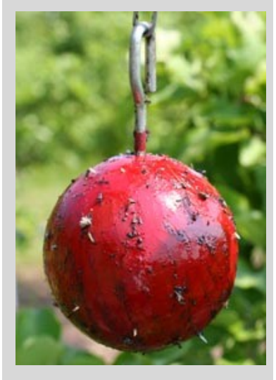
Figure 13. Red sphere trap.