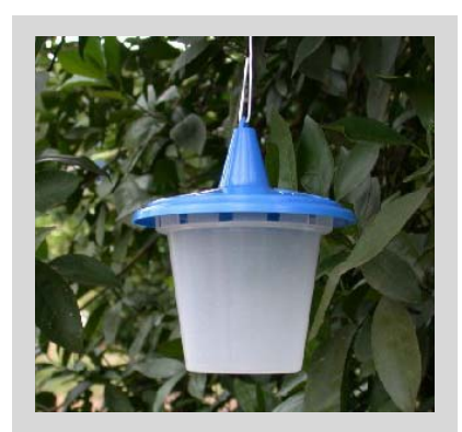
Figure 14. Sensus trap.

The Tephri trap is similar to a McP trap. It is a vertical cylinder 15 cm high and 12 cm in diameter at the base and can hold up to 450 ml of liquid (Figure 18). It has a yellow base and a clear top, which can be separated to facilitate servicing. There are entrance holes around the top of the