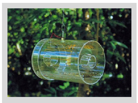
Figure 15. Conventional Steiner trap.