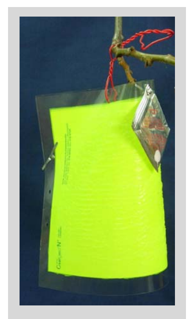
Figure 4. Fluorescent yellow sticky cloak trap.