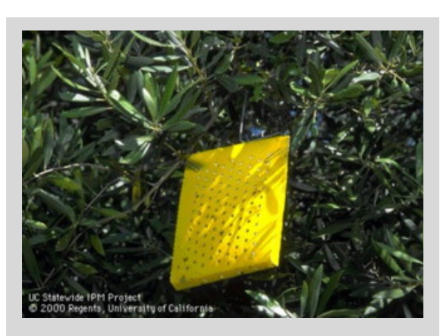
Figure 2. ChamP trap.