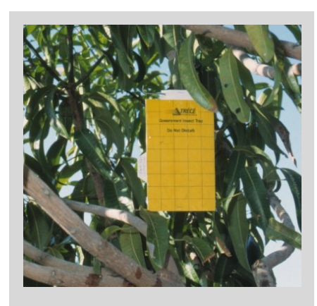
Figure 19. Yellow panel trap.

The Yellow panel trap (YP) consists of a yellow rectangular cardboard plate ( 23~\text{cm} \times 14~\text{cm} ) coated with plastic (Figure 19). The rectangle is covered on both sides with a thin layer of sticky material. The Rebell trap is a three-dimensional YP-type trap with two crossed yellow rectangular plates ( 15~\text{cm} \times 20~\text{cm} ) made of plastic (polypropylene) making them extremely durable (Figure 20). The trap is also coated with a thin layer of sticky material on both sides of both plates. A wire hanger, placed on top of the trap body, is used to hang it from tree branches.