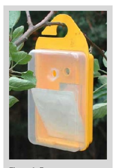
Figure 3. Easy trap.

The trap is multipurpose. It can be used dry baited with parapheromones (e.g. TML, CUE, ME) or synthetic food attractants (e.g. 3C and both combinations of 2C attractants) and a retention system such as dichlorvos. It can also be used wet baited with liquid protein attractants holding up to 400 ml of mixture. When synthetic food attractants are used, one of the dispensers (the one containing putrescine) is attached inside to the yellow part of the trap and the other dispensers are left free.