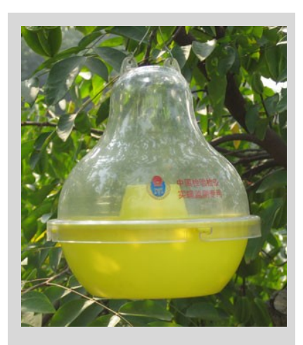
Figure 9. Plastic McPhail trap.

The nature of its attractant means this trap is more effective at catching females. Food attractants are generic by nature, and so McP traps tend to also catch a wide range of other non-target tephritid and non-tephritid fruit flies in addition to the target species.