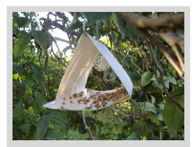
Figure 5. Jackson trap or Delta trap.

For many years this trap has been used in exclusion, suppression or eradication programmes for multiple purposes, including population ecology studies (seasonal abundance, distribution, host sequence, etc.); detection and delimiting trapping; and surveying sterile fruit fly populations in areas subjected to sterile fly mass releases. JT/Delta traps may not be suitable for some environmental conditions (e.g. rain or dust).