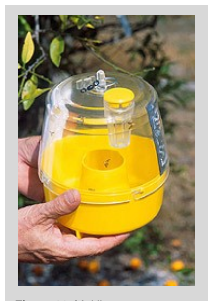
Figure 11. Multilure trap.

When the MLT is used as a dry trap, a suitable (non-repellent at the concentration used) insecticide such as dichlorvos or a deltamethrin (DM) strip is placed inside the trap to kill the fruit flies. DM is applied to a polyethylene strip placed on the upper plastic platform inside the trap. Alternatively, DM may be used