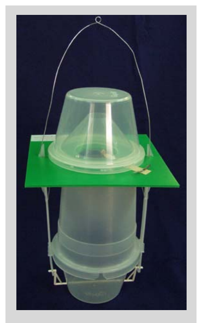
Figure 10. Modified funnel trap.