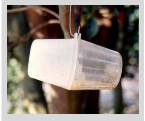
Figure 17. Steiner trap version.