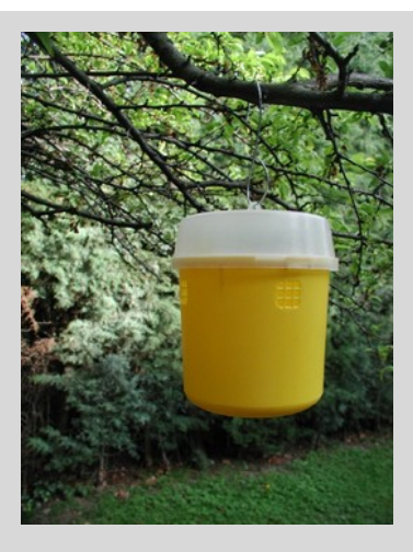
Figure 18. Tephri trap.

The trap is baited with hydrolysed protein at 9% concentration; however, it can also be used with other liquid protein attractants as described for the conventional glass McP trap or with the female dry synthetic food attractant and with TML in a plug or liquid as described for the JT/Delta and Yellow panel traps. If the trap is used with liquid protein attractants or with dry synthetic attractants combined with a liquid retention system and without the side holes, the insecticide will not be necessary. However, when used as a dry trap and with side holes, an insecticide solution (e.g. malathion) soaked into a cotton wick or other killing agent is needed to avoid escape of captured insects. Other suitable insecticides are dichlorvos or deltamethrin (DM) strips placed inside the trap to kill the fruit flies. DM is applied in a polyethylene strip, placed on the plastic platform inside the top of the trap. Alternatively, DM may be used in a circle of impregnated mosquito net and will retain its killing effect for at least six months under field conditions. The net must be fixed on the ceiling of the inside of the trap using adhesive material.